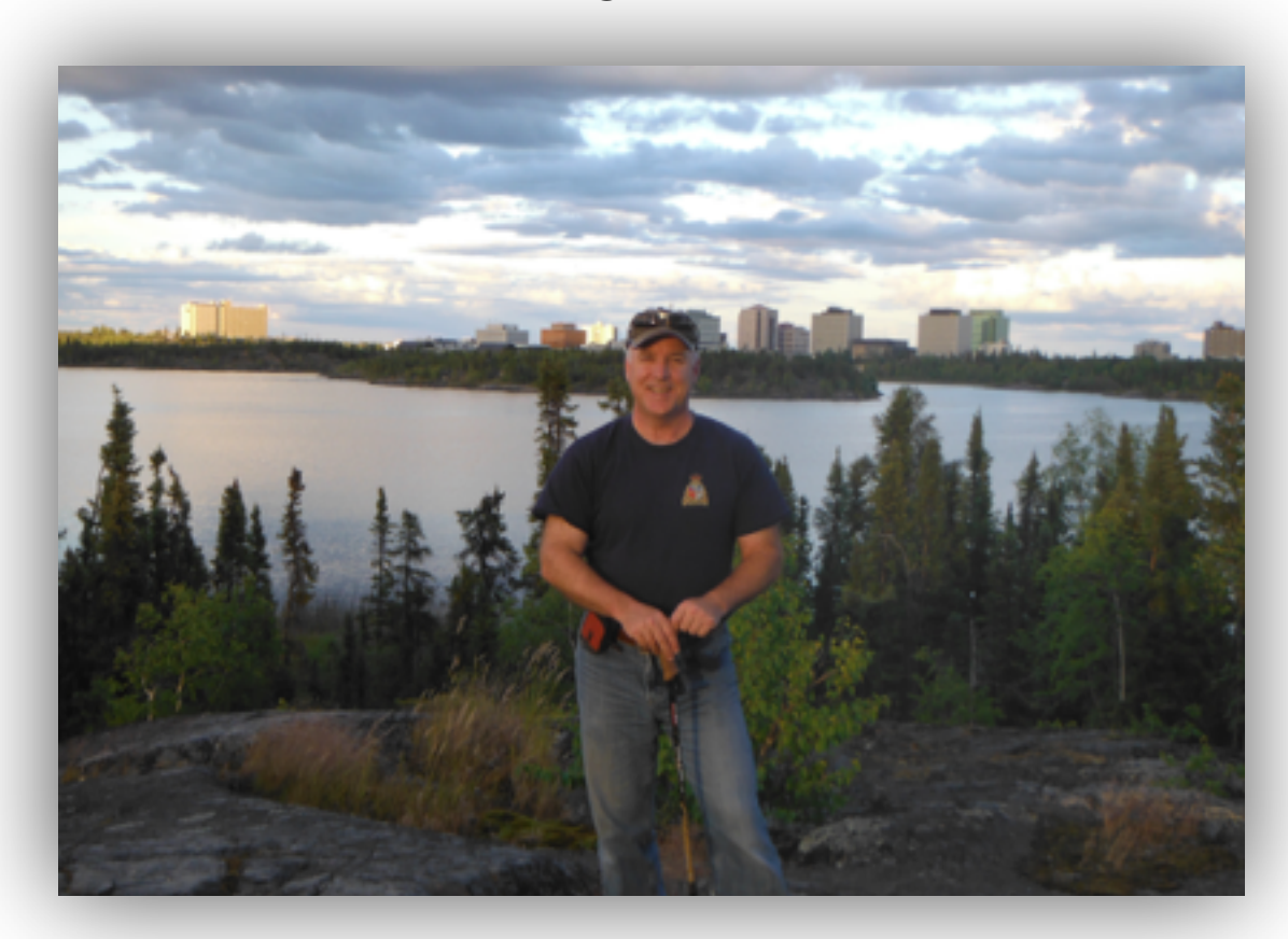
July 2013 near Yellowknife,

On January 6, 2015, I was selected to become the Executive Officer of the RCMP Veterans' Association, an important role in the Association that I am honoured to accept. Like my father and brother, I am proud to have served in the Royal Canadian Mounted Police (RCMP) and to count myself a "veteran." I served in the Force for seven years from 1978 to 1985, and was posted in "E" and "G" Divisions. I left the Force in 1985 to pursue careers in the Foreign Service and then in the Canadian Army, but throughout the intervening time I continued to feel pride in having served in the Force. Now I have been given this opportunity to return to my first regimental family and to be service to this historic association and my fellow veterans.