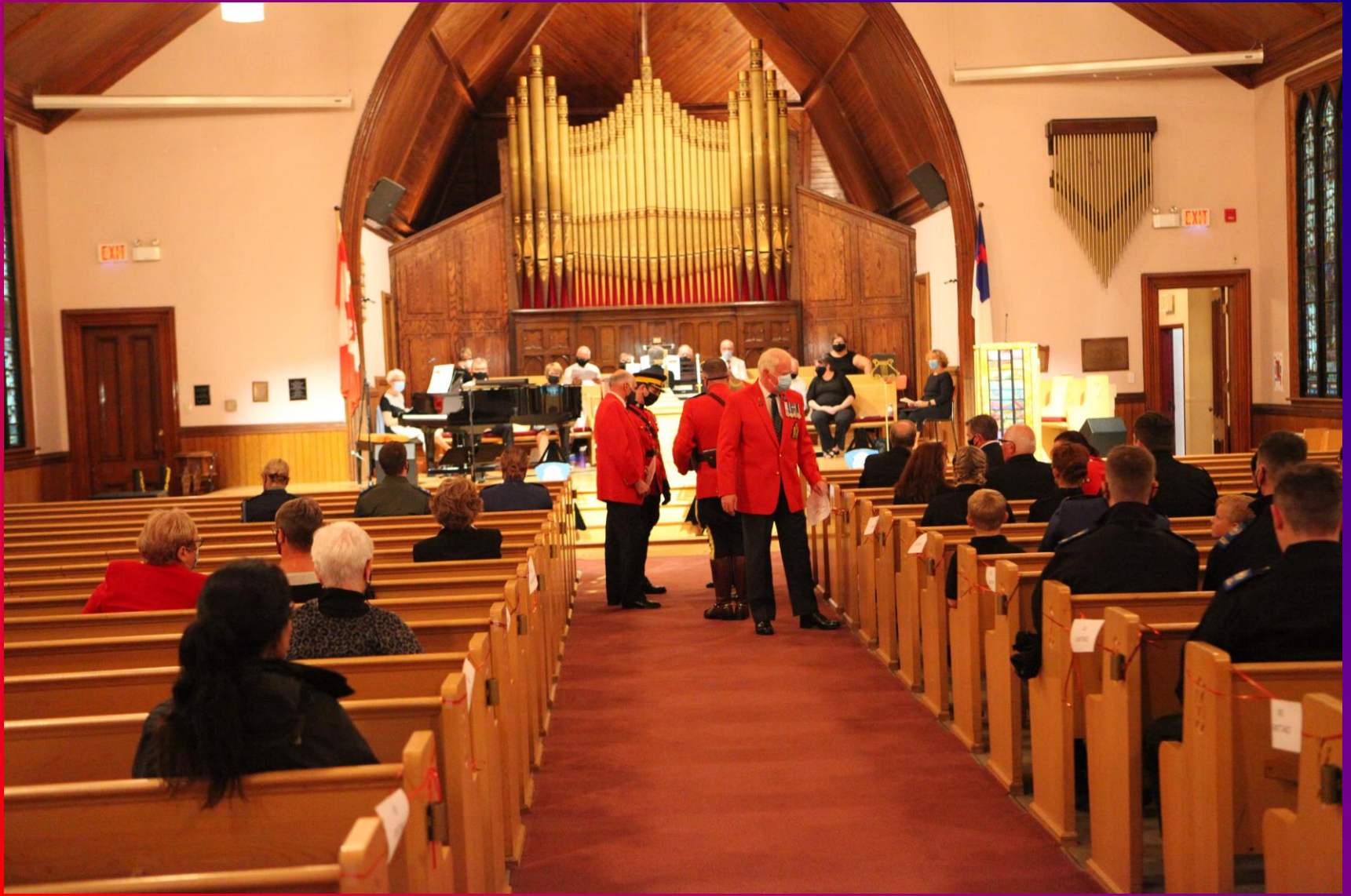
Final Preparation Before the Service