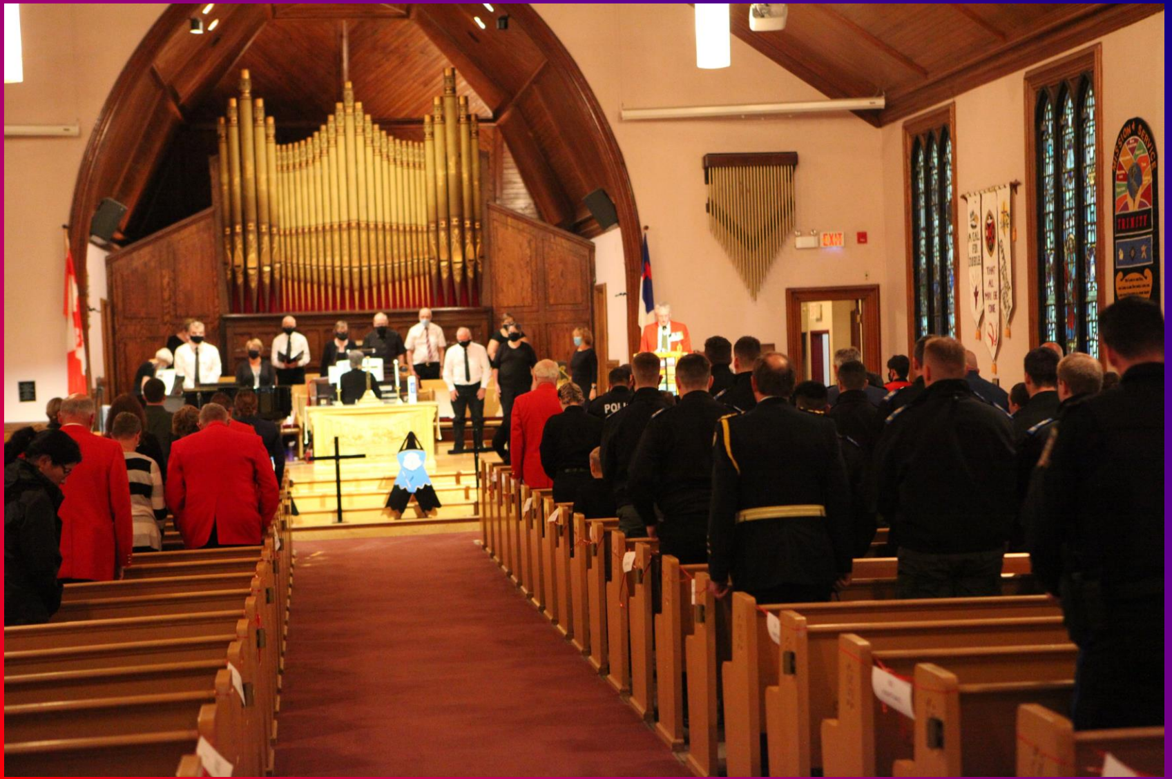
The Memorial Service was attended by 100 People, the largest in some time.