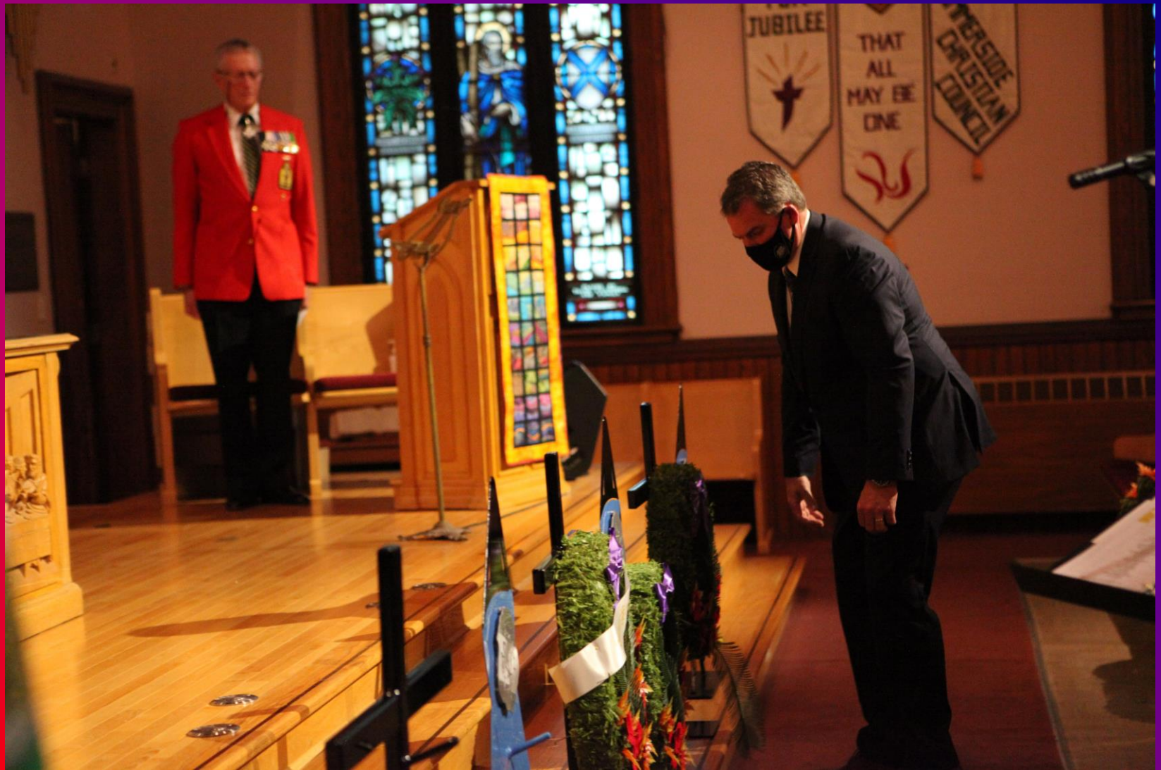
The Hon. Bloyce Thompson, Minister of Justice / MLA On Behalf of the Province of Prince Edward Island