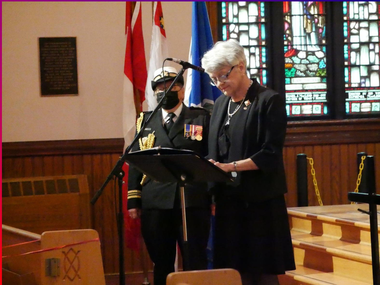
Words of Welcome from the Royal Family