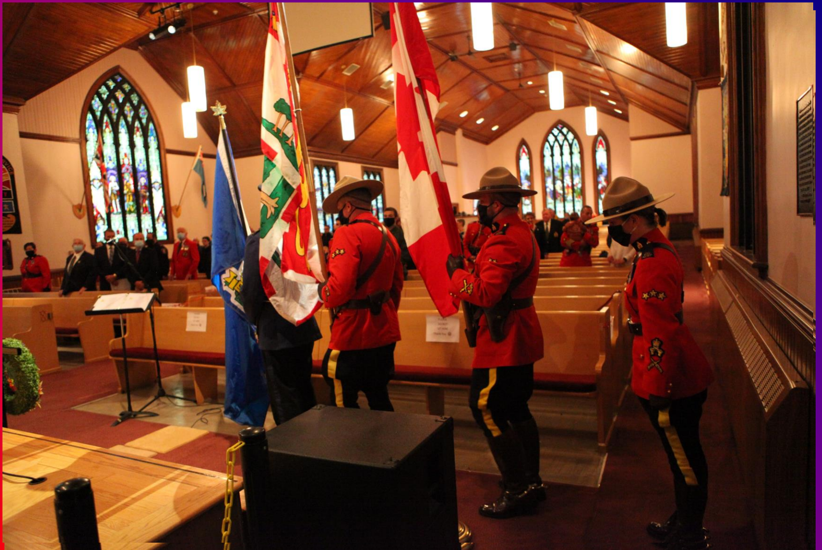
The Service Concludes with the Retirement of the Colours