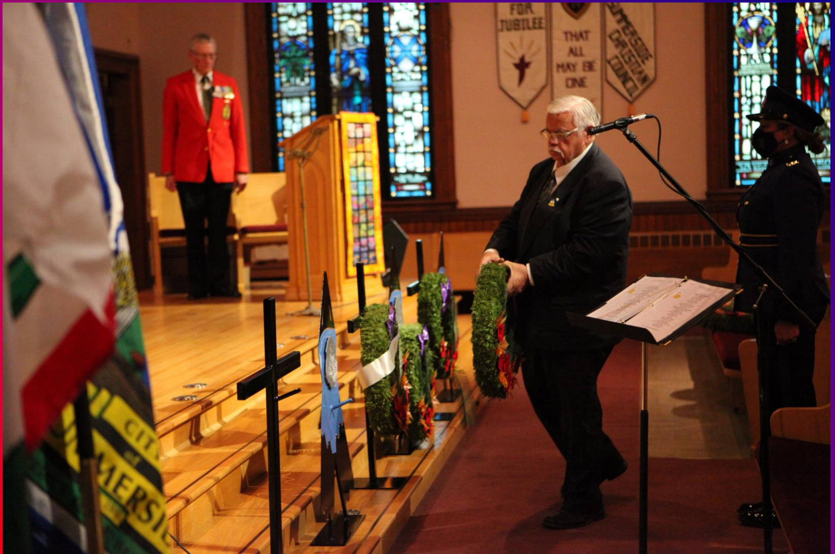
His Worship, Mayor Basil Stewart On behalf of the City of Summerside