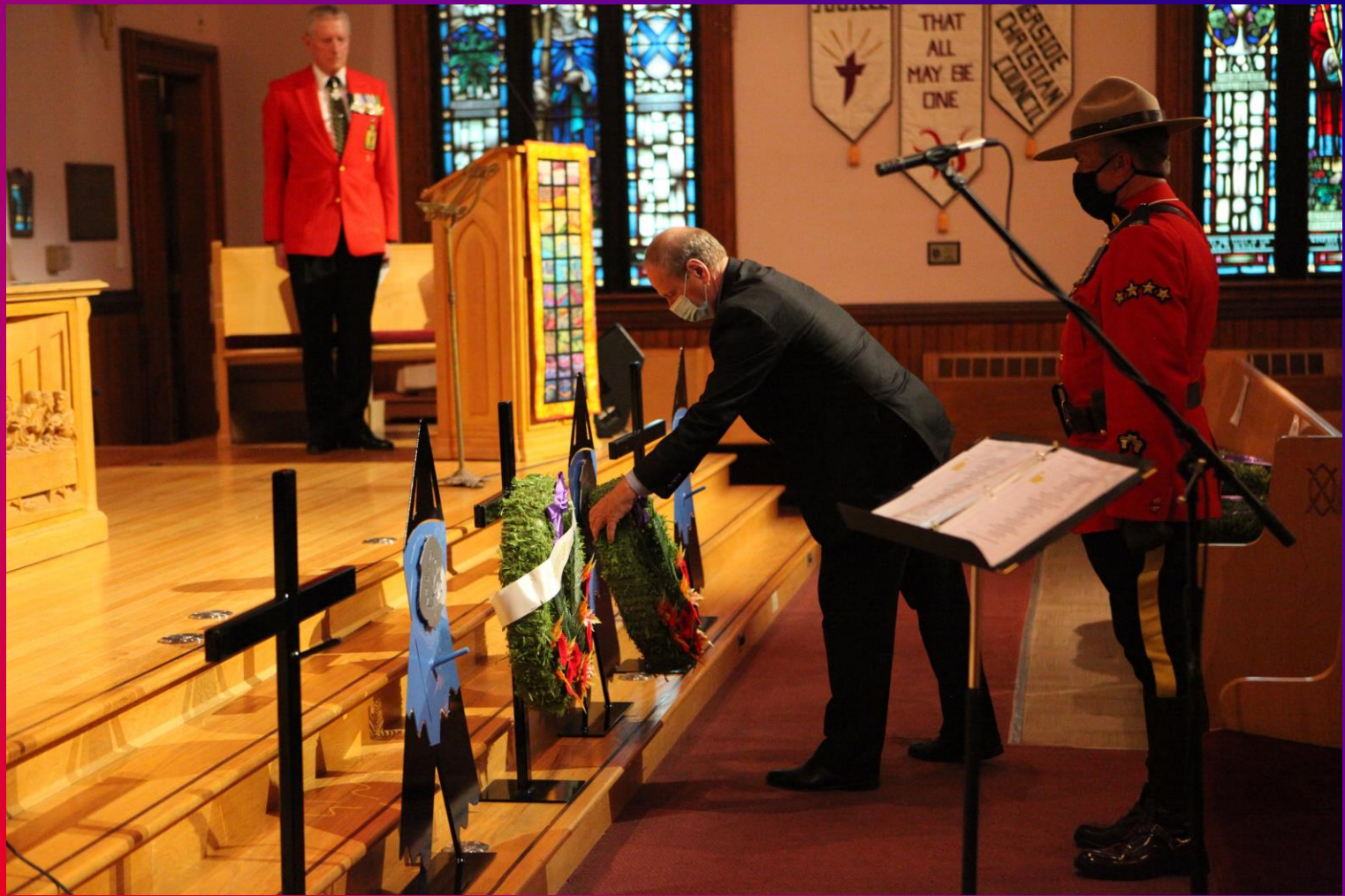
Robert Morrissey, MP for Egmont On behalf of the Government of Canada